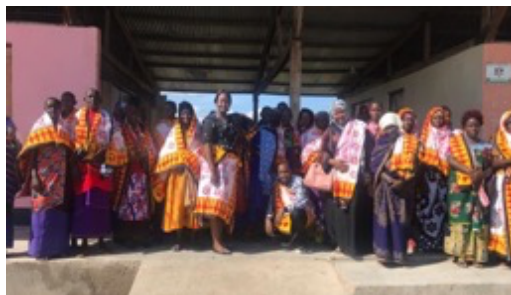
Picture taken during the single mother's event

In September 10 single mothers were visited both in Londoto and Chemchem villages. Most of them are doing well. Their business performance was reviewed against their plans and for some a business growth of 15% per month was witnessed. Out of the 10 from both villages 2 single mothers are not doing well, we found out that the money given to them did not meet the intended goal. But the rest are doing well, some have used their profit to buy iron sheets, built houses and others have bought livestock.